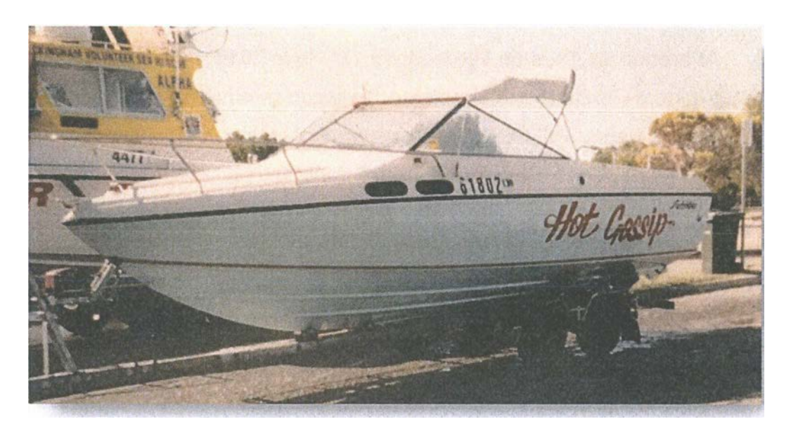
Fig 3.1 - Photo of vessel 61802 'Hot Gossip'